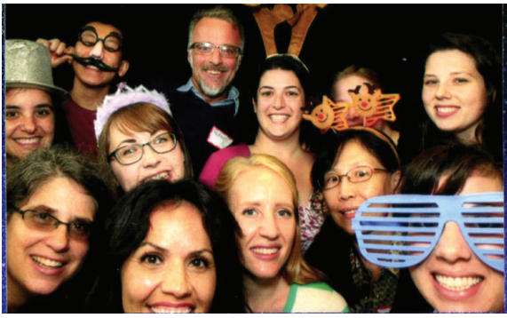
Happy New Year from the Psychology Department!